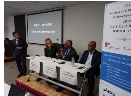
The foreign experts shared their perspectives on the Programmes