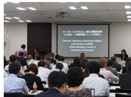
The discussion was active