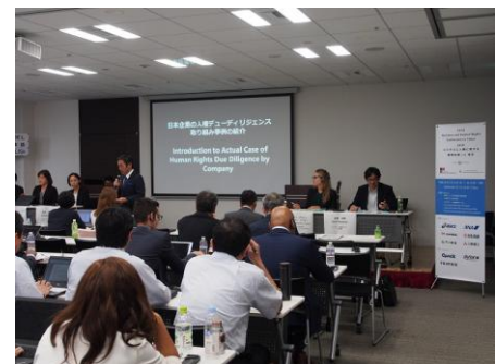
The speakers shared their perspectives