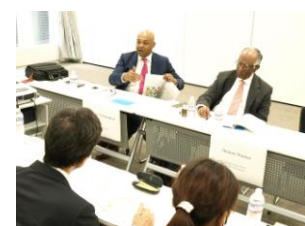
Active discussions were conducted

Prior to the conference, the eight individual dialogues were conducted between sponsoring companies and human rights experts. The companies shared their human rights and CSR activities, and exchanged views with the experts on how to enhance their management. The attendees commented that they could gain new perspectives through the dialogues.