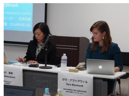
The speakers shared a trend on investors and responsible investment