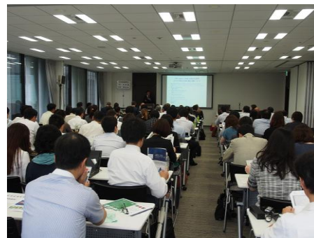
Active discussions were conducted.