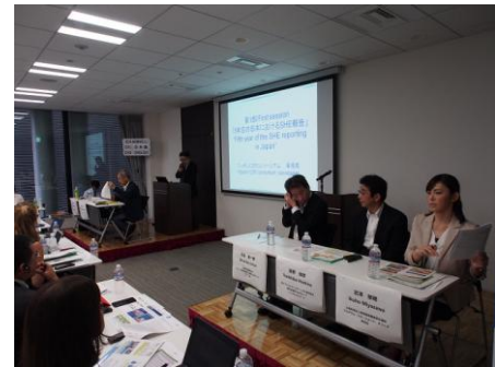
Stakeholder Engagement Programmes were introduced