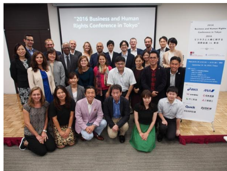
Picture with the speakers and sponsoring companies

The programme on Day I had the session on “Introduction to Global Trends of Business and Human Rights” in which global experts on business and human rights provided leadership perspectives on the business and human rights agenda and current global trends. Also, the “Stakeholder Engagement Programmes” in Japan and Thailand, which CRT Japan organized and implemented as the secretariat, and the actual case of human rights due diligence by company were introduced. The programme on Day II focused on the four themes; Responsible Supply Chain, Access to Remedy, Business and Human Rights and Investors (CHRB), and Mega-Sporting Event and Human Rights. Under these themes, the global experts and attendees discussed how to promote responsible behaviour to advance a respect of human rights. Approximately the more than 200 attendees were from governments, companies and NGOs. Prior to the conference, the eight individual dialogues were conducted between sponsoring companies and human rights experts.