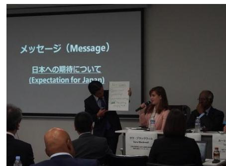
The experts shared their expectation for Japan

The experts explored the current trends as followed : the influence of Modern Slavery Act in the UK; development of Corporate Human Rights Benchmarking initiated by institutional investors; human rights issues at Mega-Sporting Events; convergence and simplification of standards; risk assessment covering multi-tier suppliers and data analysis; promotion of human rights in business relationships; dissemination and development of National Action Plans inside and outside of Europe; and lastly continuous attacks on workers trade union organizations. During the course of the session, the experts agreed on implementation of collaborative work between companies and governments to advance a respect of human rights further, and stressed the importance of global-level communication and human rights education.