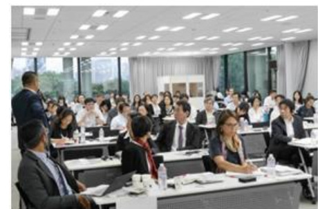
(Discussions were lively and interactive)