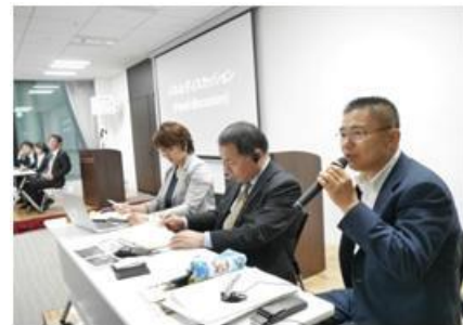
(Discussion between companies and NGOs)

The afternoon session addressed the human rights issues that emerged as of paramount important from the Stakeholder Engagement Program organized by CRT-Japan this year, including Empowerment of Women, Labor Issues, Food Issues and Sexual Minority. Japanese NGOs (Gender Action Platform, Solidarity Network with Migrants Japan, Japan Farmers GAP Association, and NijjiroDiversity) gave presentations on these agendas respectively, while NYK LINE presented their activities