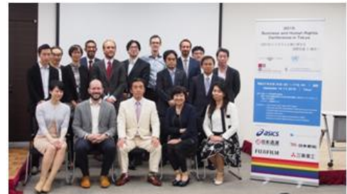
(The picture with sponsoring companies and speakers)