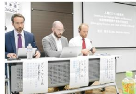
(6 organizations from overseas were invited)

On Day I, the morning session examined the theme of “Introduction to Global Trends of Business and Human Rights”. Under this theme, IHRB, BHRRC, DIMR, DIHR, ICAR and Sedex provided leadership perspectives on the agenda for business and human rights, and current global trends. The addressed issues were as followed: “Top 10 Business and Human Rights Issues 2016” initiated by IHRB, human rights issues in Mega-Sporting Events, development of “National Action Plan”, the business contribution to sustainable development post-2015, state implementation of the UNGPs in Germany, human rights issues in Japan, and social and environmental issues in supply chains in Asia. Many participants offered their opinions regarding this session that they could gain their understanding on current trends of business and human rights and contents of on-going activities of global initiative organizations. Also, they felt the need for bringing these business and human rights perspectives into daily business operations to advance a respect of business and human rights within and outside their companies.